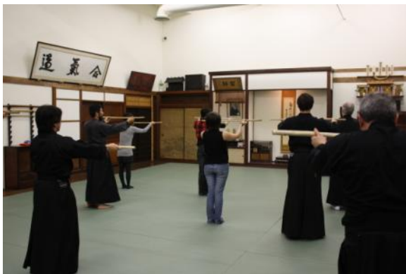
Idyllwild Arts Academy