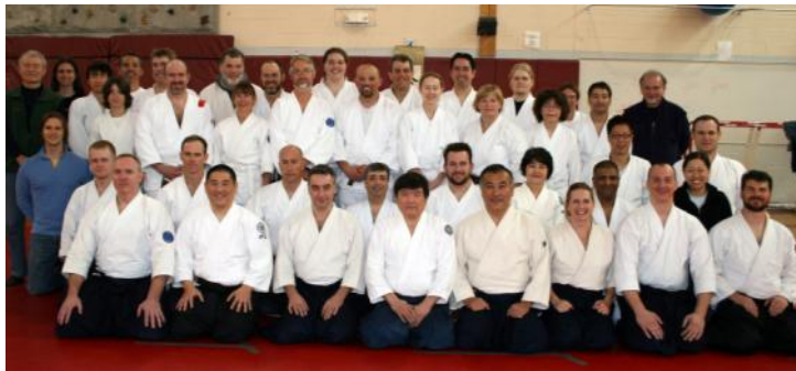
LMS Aikido Seminar in Denver, Colorado