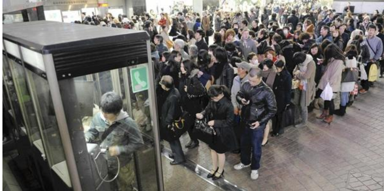
People lining up to use the telephone at Shibuya Station when mobile phone communication was interrupted after the earthquake.

express something like shudan ishiki , amae , and jishuku . Etiquette feels easy when things go well, but when disaster hits etiquette means the most. With one disaster, the Japanese showed us how we can live our lives in a different way and towards a higher good.