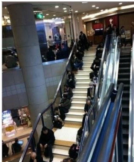
People sitting to the side of the stairs, leaving a clear and accessible aisle.