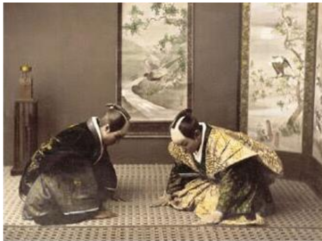
Samurai bowing at the turn of the century

In all practice, watch your ma-ai . We see Aikido as an exercise or sport, this is why we are not conscious of our spacing. We only appreciate this spacing because we are practicing a martial art. Please be careful in this! We relax this awareness because a sports consciousness permeates our present culture so deeply. We must be careful at all times not to bring the wrong attitude into our practice. This is how martial arts is changing today. . . . How sad!