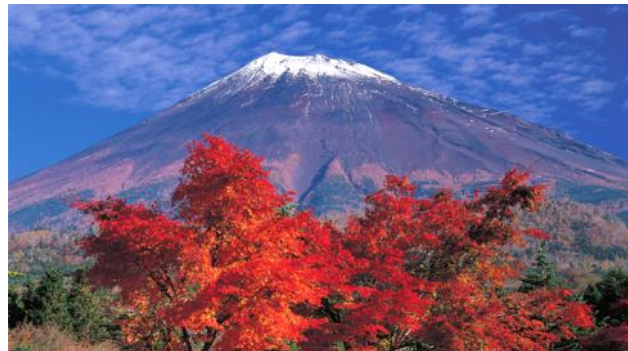
Mt. Fuji adorned with lovely fall colors

with our partners advances it creates alignment and this alignment enables us to "see" things from a different perspective. With a changed perspective we can choose to act differently.