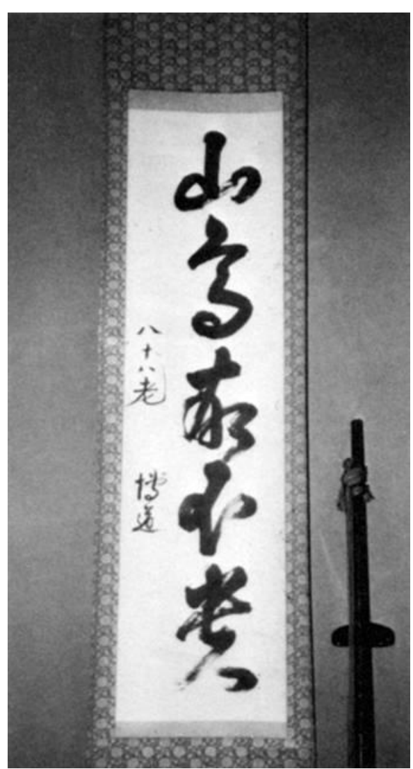
Yama takaki ga yue ni tattokarazu "A mountain is not imposing only because it is high."

accolades or accomplishments and when it is a good time to promote them or hold them back?