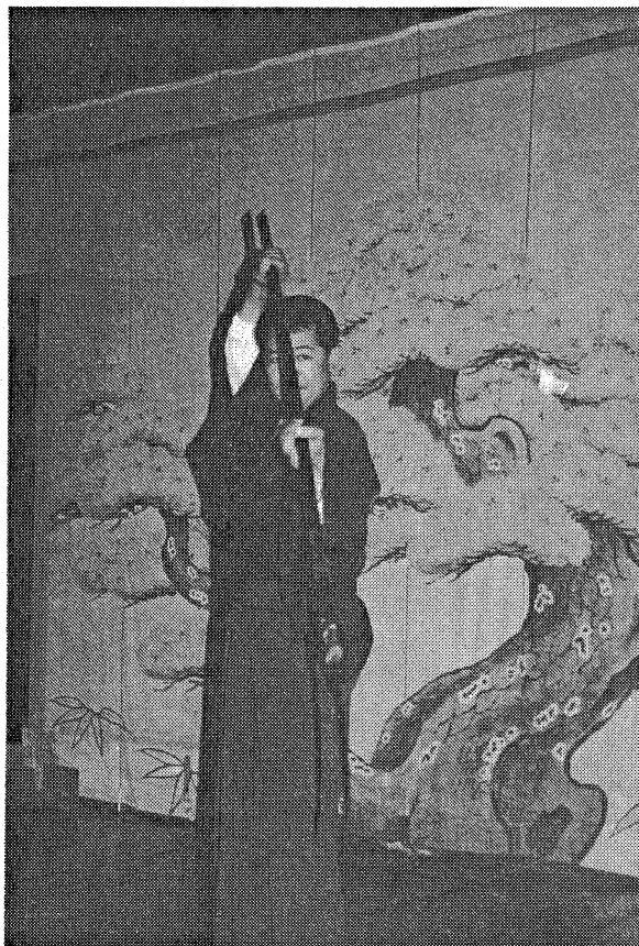
There will be demonstrations of naginata (halberd) and spear along with Japanese swordsmanship and Aikido on August 26th at the Japan America Theatre.